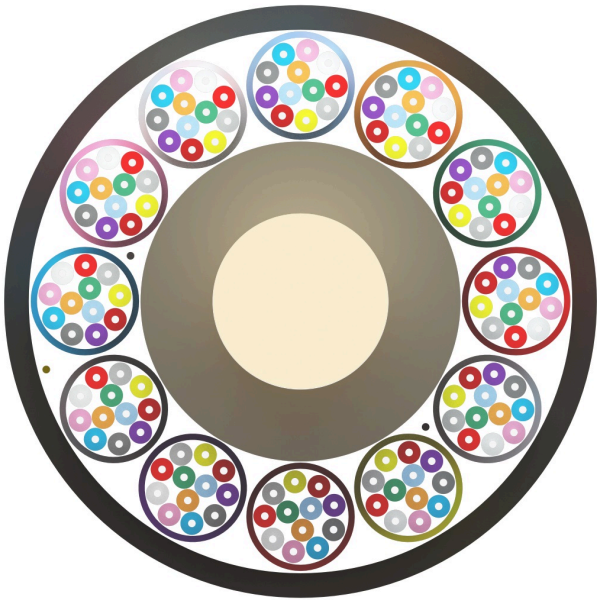
Colour coding (as per TIA-598-C)