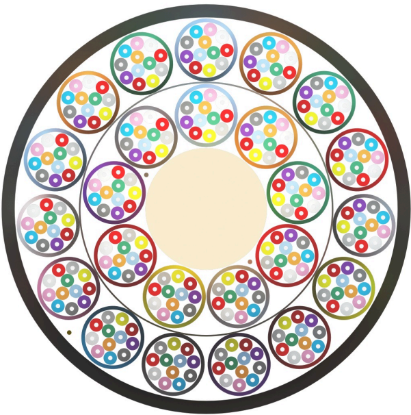
Colour coding (as per TIA-598-C)