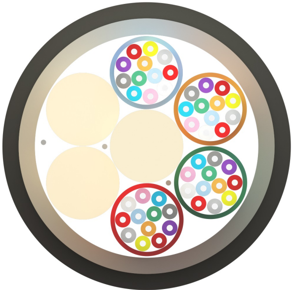
Colour coding (as per TIA-598-C)