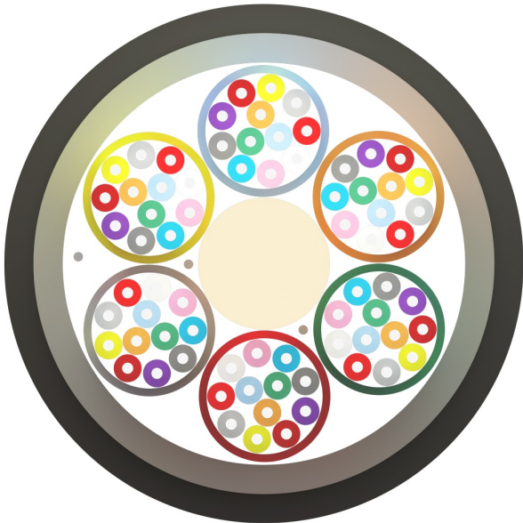
Colour coding (as per TIA-598-C)