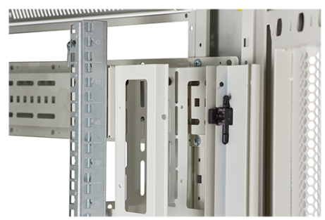
High-density vertical cable management