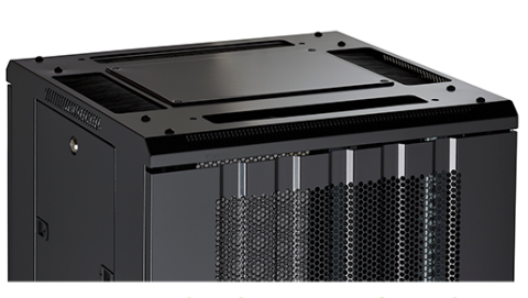
Four-way brush entry roof panel