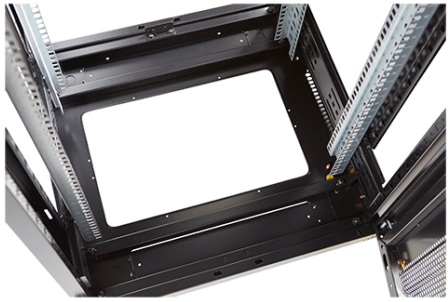
Large base entry