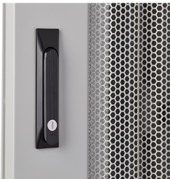
Swing handle wave vented front door