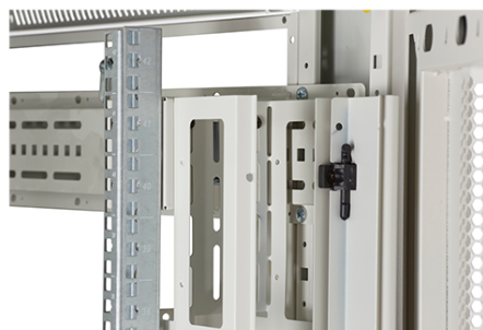
High-density vertical cable management