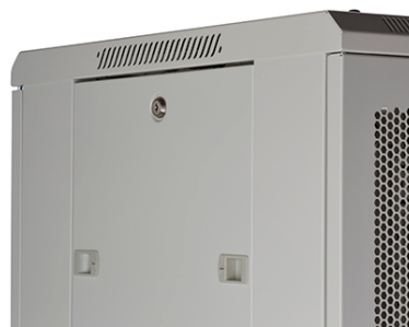
Quick-slam latch side panels