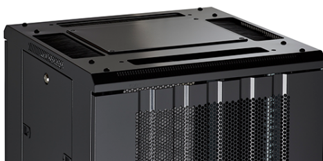
Four-way brush entry roof panel