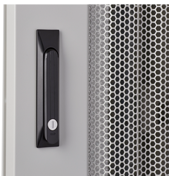
Swing handle wave vented front door