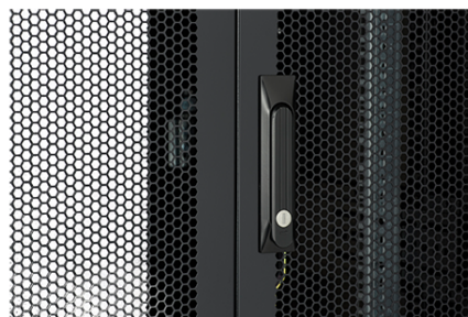
Wardrobe vented rear doors