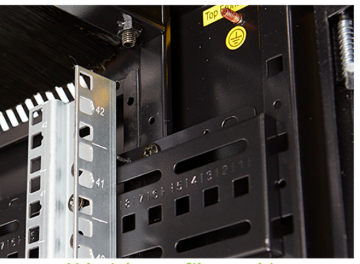
U height profile markings