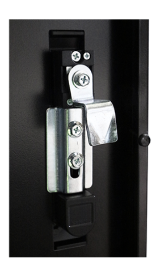
Inner door lock