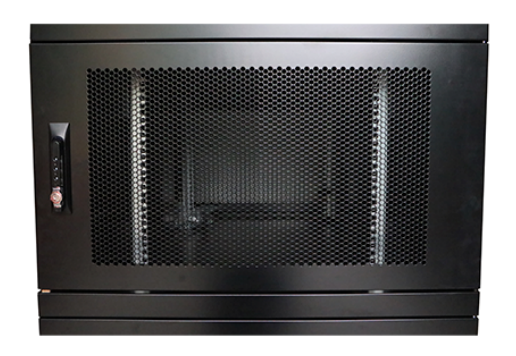
Mesh compartment doors