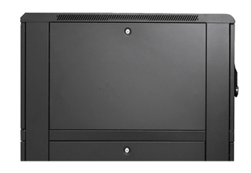
Removable side panels