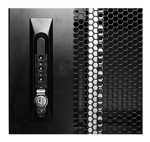
Key and 3-digit combination locks