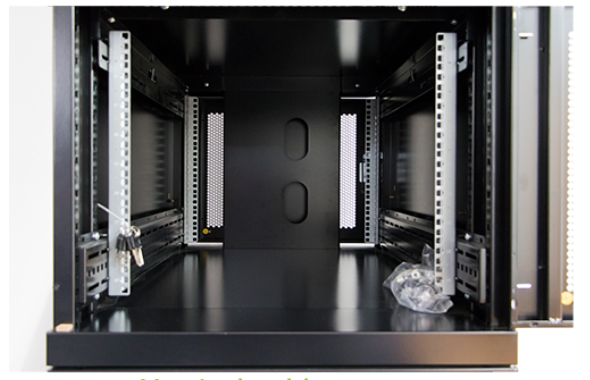
Vertical cable management