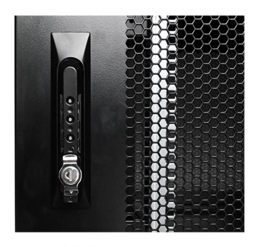
Key and 3-digit combination locks