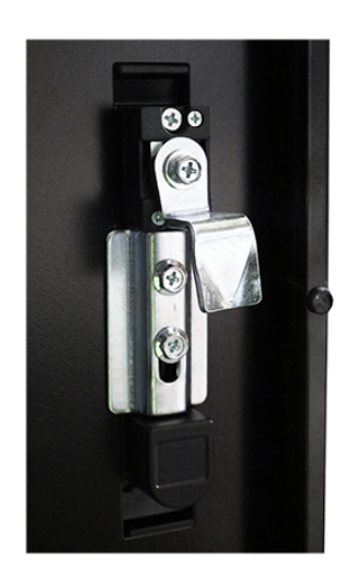
Inner door lock