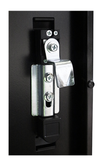
Inner door lock