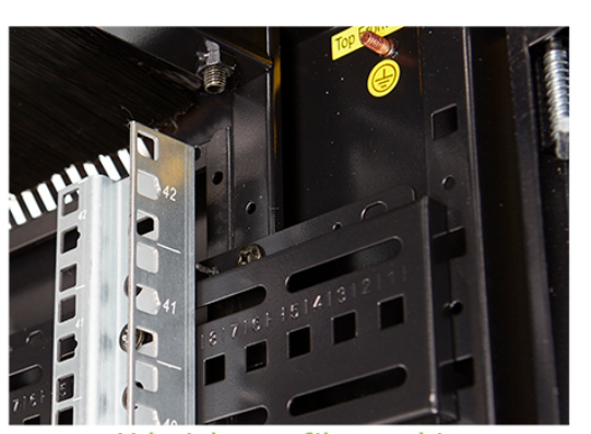
U height profile markings