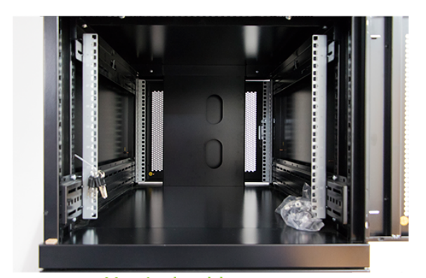
Vertical cable management