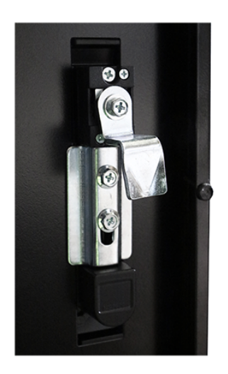
Inner door lock