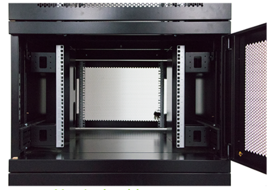
Vertical cable management