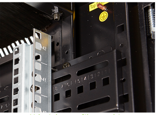
U height profile markings