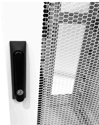
Front Swing Handle Mechanical lock