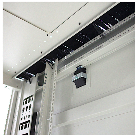
Quick slam latches and position No.s