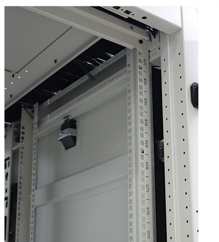
Airflow Management Baffles