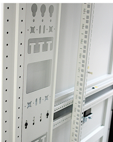
PDU mounting Cable Tray