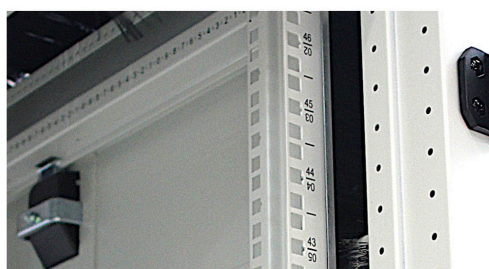
Profile Double numbering top to bottom