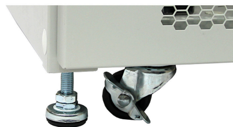
Castors and Jacking Feet as standard