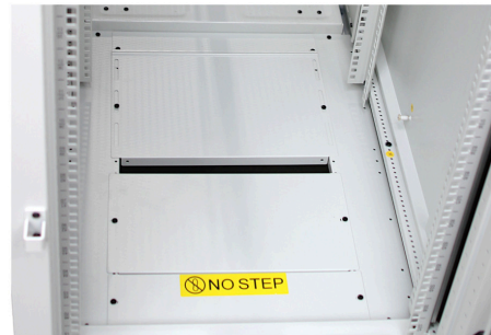
Base with large cable entry