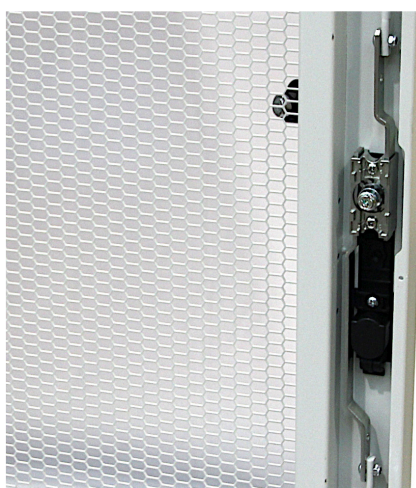
80% Ventilation Rate Mesh