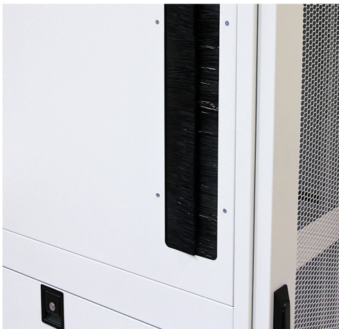
Side Panel Brush Strip and latch