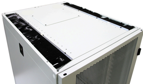
Roof with full length Brushes