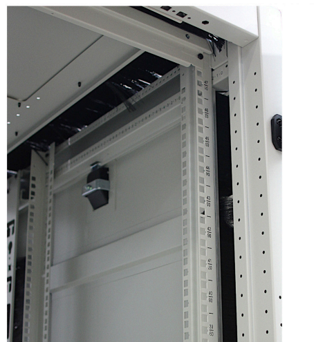
Airflow Management Baffles