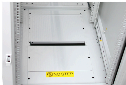
Base with large cable entry