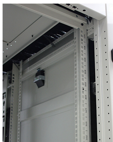
Airflow Management Baffles