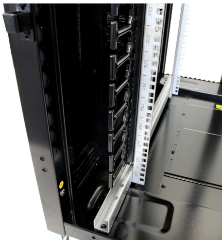
Front Finger Cable Management