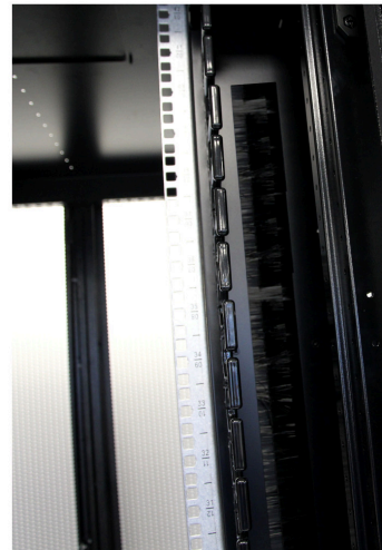
Airflow Management Baffles