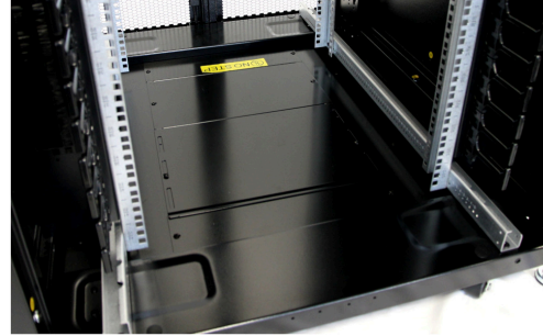
Base with large cable entry