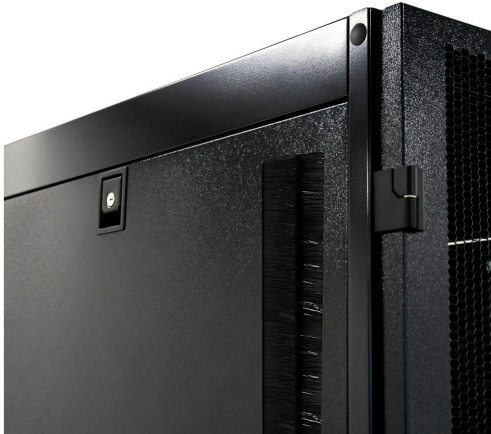
Side Panel Brush Strip and latch