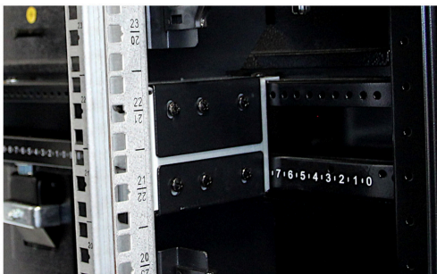
Profile Double numbering top to bottom