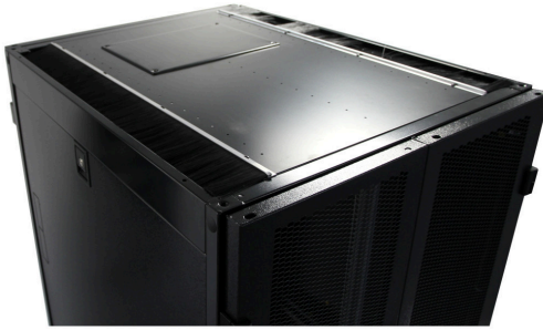
Roof with full length Brushes