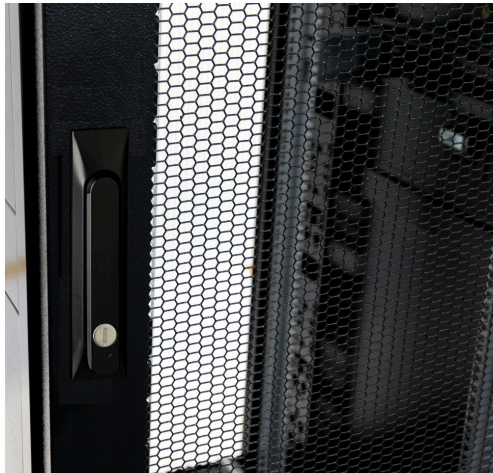
Front Swing Handle Mechanical lock