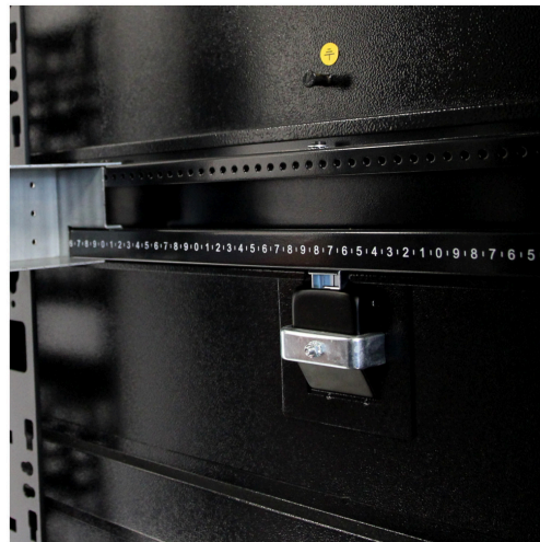
Quick slam latches and position No.s