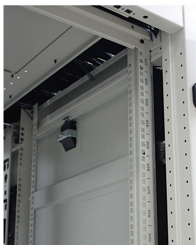
Airflow Management Baffles