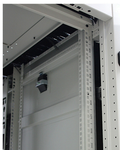
Airflow Management Baffles