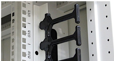
Profile Double numbering top to bottom