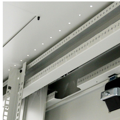
Quick slam latches and position No.s