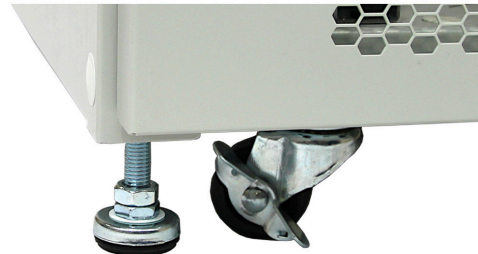
Castors and Jacking Feet as standard