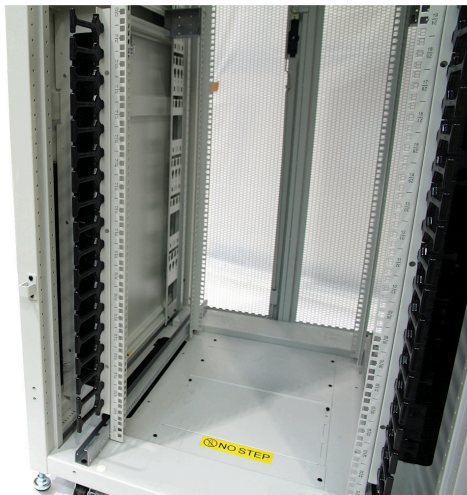
Front Finger Cable Management