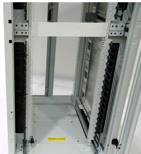
Airflow Management Baffles