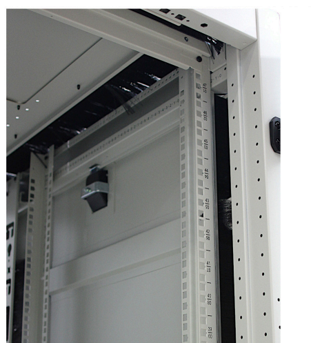
Airflow Management Baffles