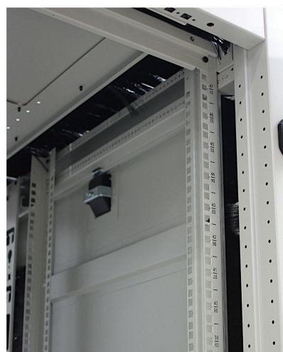
Airflow Management Baffles