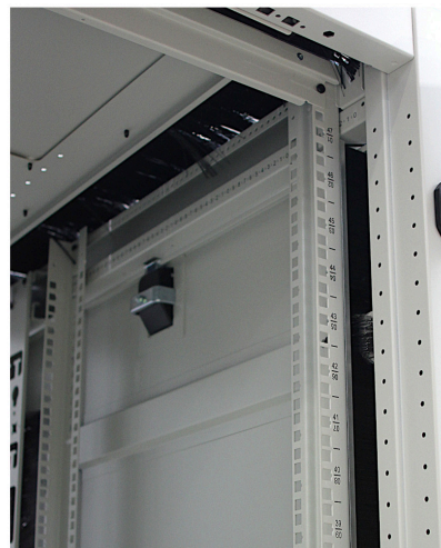
Airflow Management Baffles