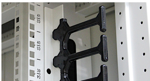
Profile Double numbering top to bottom