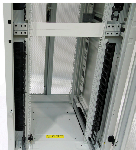
Airflow Management Baffles