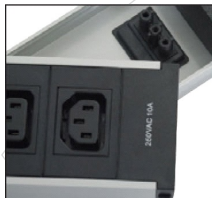
Snap in module design IEC320 C13 10AMP sockets shown