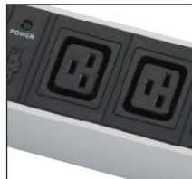
IEC320 C19 16AMP sockets