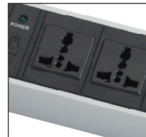
GB2099.3 universal sockets