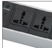
GB2099.3 universal sockets