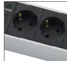
DIN49440 Schuko sockets**