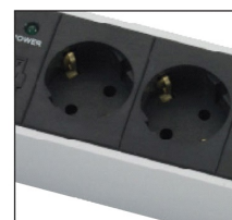
DIN49440 Schuko sockets**