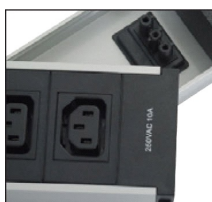
Snap in module design IEC320 C13 10AMP sockets shown