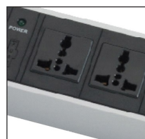
GB2099.3 universal sockets