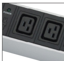
IEC320 C19 16AMP sockets